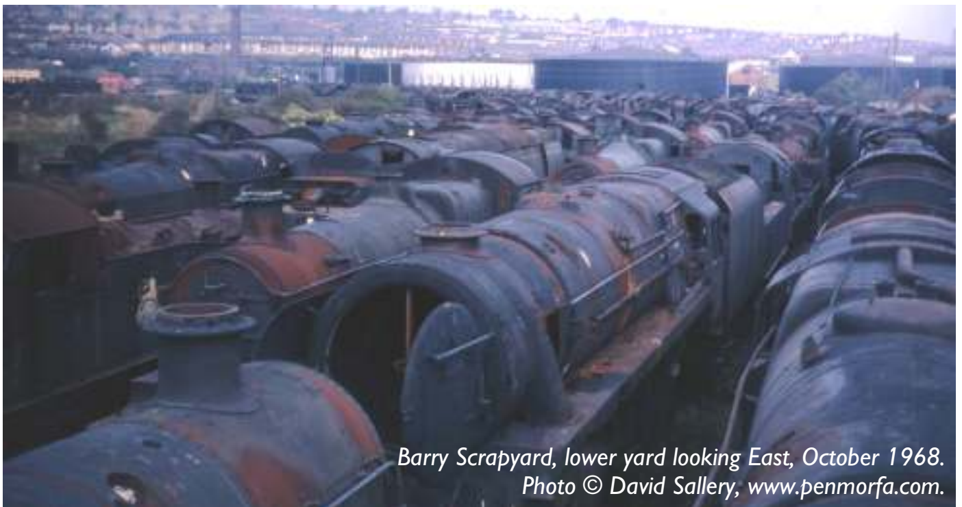
Barry Scrapyard, lower yard looking East, October 1968.