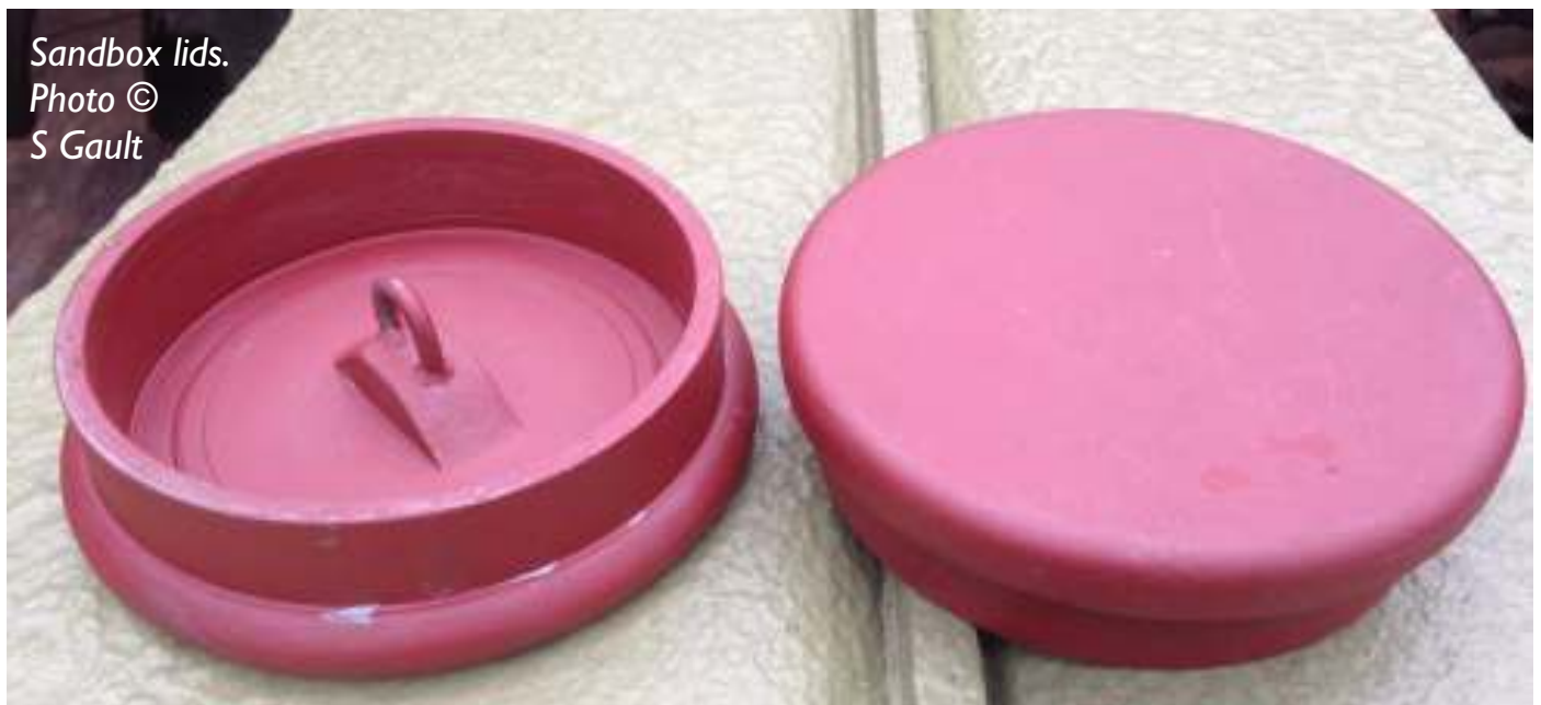
Sandbox lids.

Some of the most recent components have been new lids for the sandboxes. A well-timed visit of the T9 to the Mid-Hants Railway allowed me to closely inspect some original items and, in conjunction with a dimensioned drawing supplied by John Fry, I had all the information I needed. This time, rather than welding parts together to form the finished item, it seemed a better proposition to turn the parts on a lathe from a solid billet. Very satisfying, but there was a lot of material removal required, creating what seemed like wheelbarrows-full of swarf, and eating away hours of time. Like a lot of these jobs, I'd start off intending to do a quick half hour after work and then arrive home at 10 o'clock for a very late dinner and bath. Showing the finished part to my wife didn't always elicit quite the same enthusiasm as I felt myself!