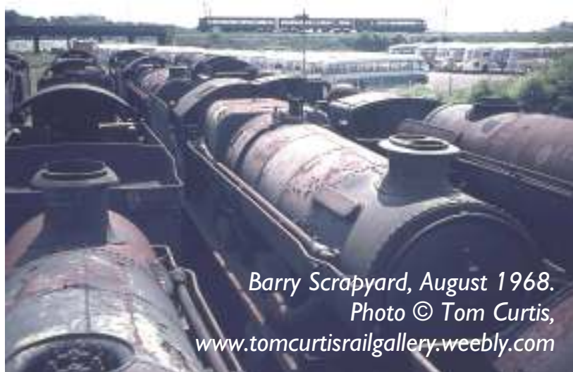
Barry Scrapyard, August 1968.

In 1955, the Railways Modernisation Plan envisaged the reduction of the freight wagon fleet from 1.25 million (yes, million) wagons to 600,000 and the scrapping of 16,000 steam locomotives to be replaced by diesel and electric powered locomotives. In the beginning, only wagons were sold to scrap merchants as the railway workshops coped with the scrapping of locomotives. However, by 1958, the pace of steam locomotive withdrawal outstripped the workshop capability to handle them, forcing BR to sell to scrap merchants. This created a bonanza for a number of scrap merchants around the country, who had the capability to receive and store large numbers of wagons and locomotives. These were largely in the vicinity of the steel works then working in South Wales, Scotland, the North East and Sheffield areas.