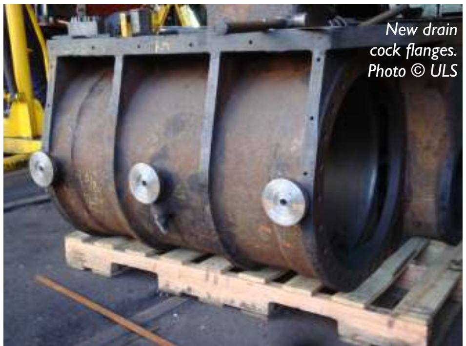
New drain cock flanges.

Restricted working space in the shed has meant only one cylinder casting at a time could be fitted to the frames. The removal of the carbon within the exhaust passages is nearly finished. The new drain cock flanges have been test-fitted and the stud holes marked out and both the old feed water heater take-offs have been blanked off with specially made plugs. The main centre casting has seen many hours of work to remedy the corrosion but it has finally been drilled and reamed to all the fixing holes.