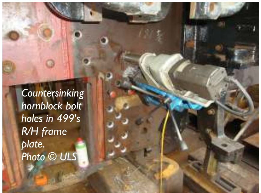
Countersinking hornblock bolt holes in 499's R/H frame plate.

With the welding of the frames completed, work on the leading set of driving wheel hornblocks has now reached the point where both are fitted to the frames, all holes drilled, reamed to 26mm diameter and countersunk. The bolting up will be carried out sometime in the future as final work will be required to remove burrs and swarf.