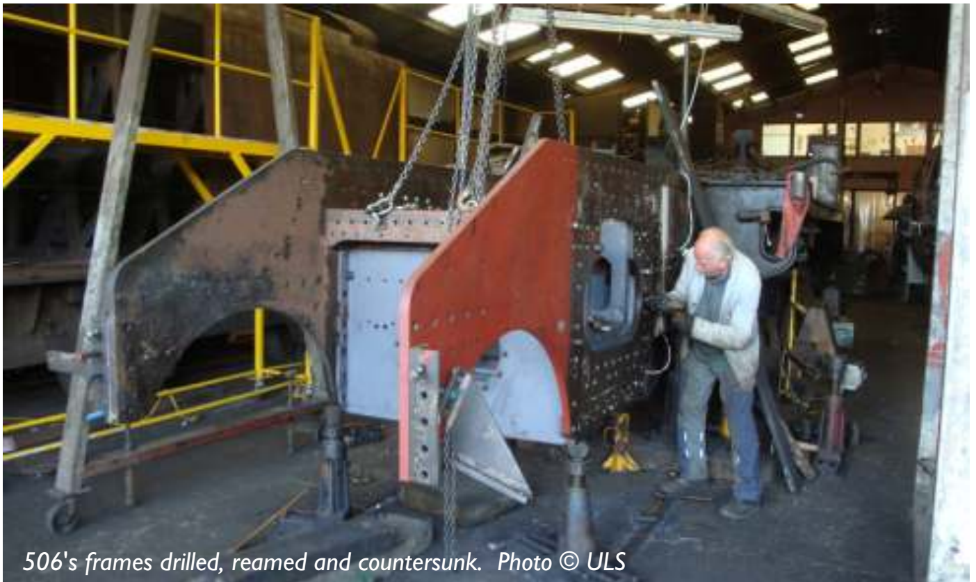
506's frames drilled, reamed and countersunk.

Work on the frames continues with all the holes to fit the cylinder drilled, reamed and, where necessary, counter-sunk.