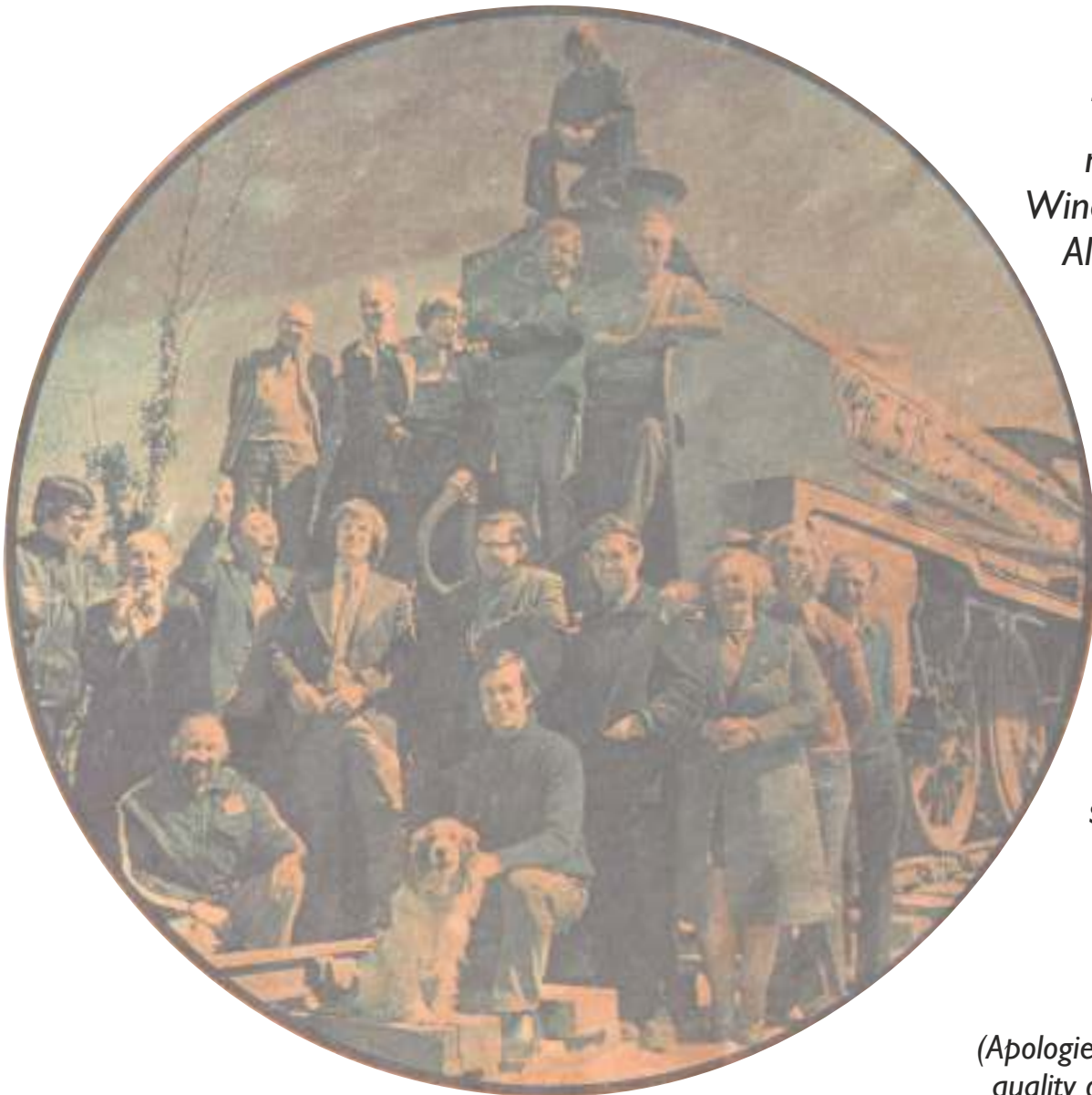
Triumphant members of Winchester and Alton Railway with locomotive number 30506, S15 class, the latest - and largest - addition to the rolling stock of the Watercress Line

These two locomotives will also be moved to Alresford by road.