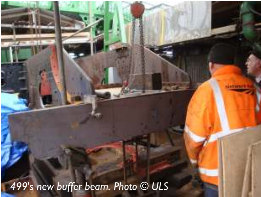
499's new buffer beam.

A new buffer beam has been made and fitted with many of the angles supporting the running plate etc being replaced, or at least refurbished. To align the buffer beam the old smokebox platform has been temporarily refitted to check that both the buffer beam and loco frames are in alignment. Also the draw hook requires some refurbish-