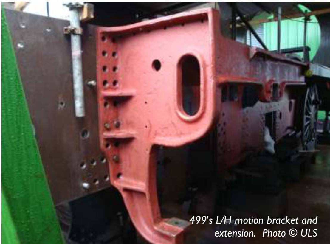
499's L/H motion bracket and extension.

The motion bracket on the left hand side was test fitted and looked good. The motion bracket stretcher had to be removed to gain access to the leading spring hanger which enabled us to bore the holes in the frames through the bracket ready for the riveting to take place.