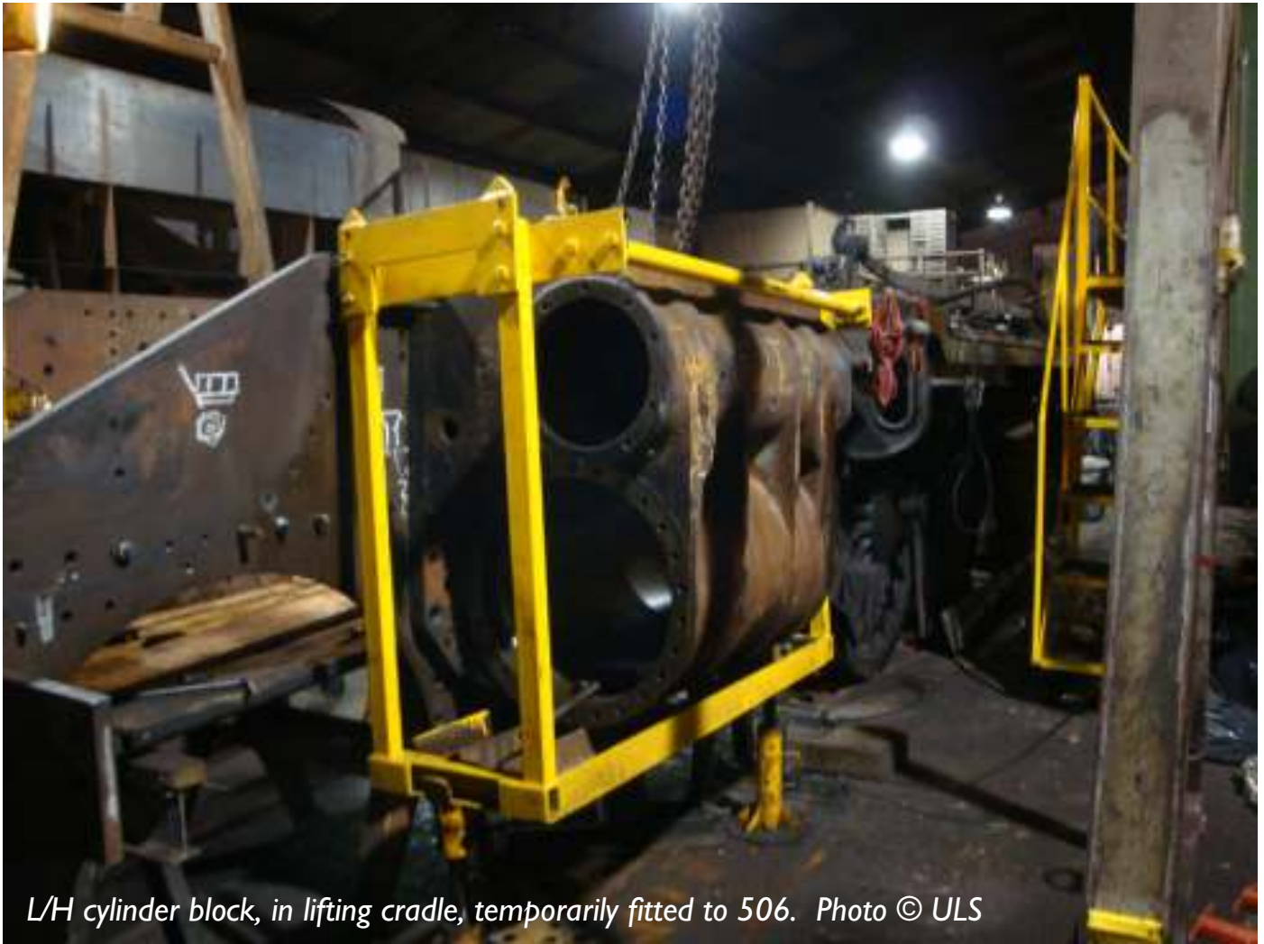
L/H cylinder block, in lifting cradle, temporarily fitted to 506.

Restricted working space in the shed has meant only one cylinder casting at a time could be fitted to the frames. The removal of the carbon within the exhaust passages is nearly finished. The new drain cock flanges have been test-fitted and the stud holes marked out and both the old feed water heater take-offs have been blanked off with specially made plugs. The main centre casting has seen many hours of work to remedy the corrosion but it has finally been drilled and reamed to all the fixing holes.